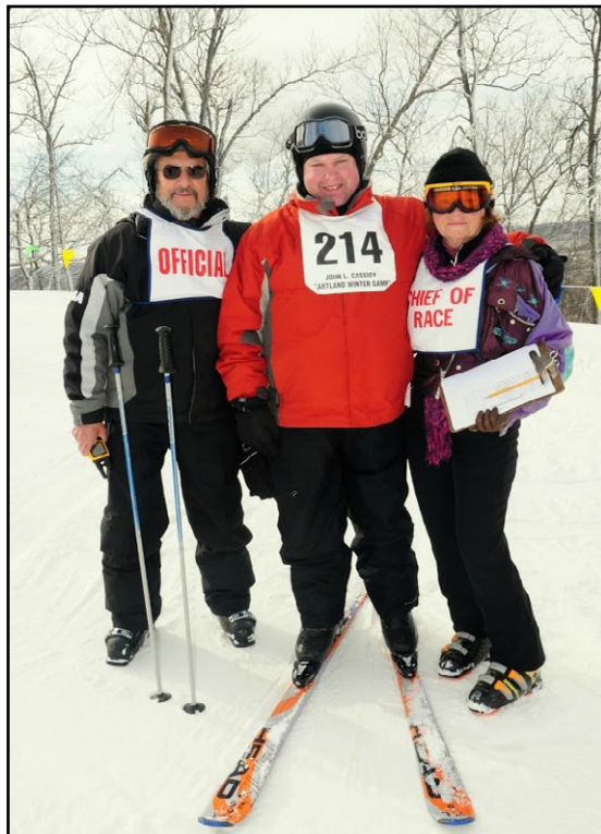
Special Olympics Winter Games