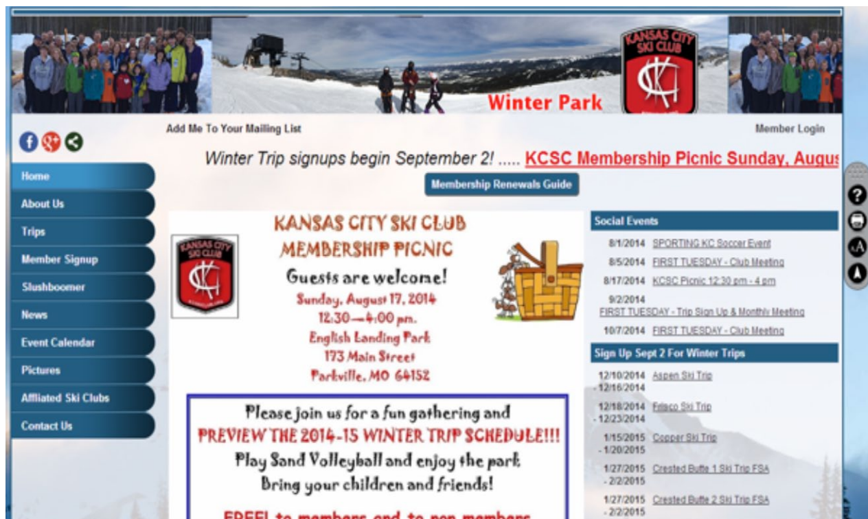
Screen shot of the club website home page

We have a family membership. Why can’t I sign up and pay for my spouse on the website? Family memberships are set up with one person as the Primary Member, their spouse as a Secondary Member, and children are Junior Members. That is the way the website software vendor handles family memberships. Membership dues are charged to the Primary Member. The Primary Member can sign up anyone on their membership for trips, and can make payments for everyone on their membership. If you would like the Primary Member changed on your family membership to you, just send an email request to websitechair@kcskiclub.org .