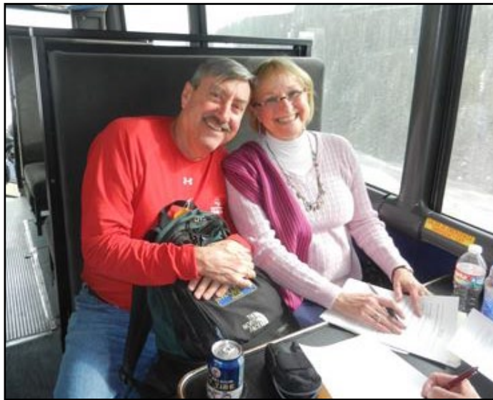
On the bus