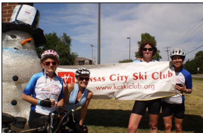
Serving the Community